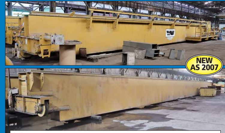
(10) Overhead Bridge Cranes to 120 Ton and 130' Span, Disassembled and ready for shipment