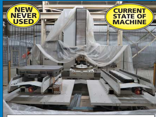
(2) 6.1" Giddings & Lewis Model MC-1250 Two-Pallet Rotary Table CNC Horizontal Boring Mills