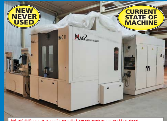
(2) Giddings & Lewis Model HMC-170 Two-Pallet CNC Horizontal Machining Centers

See website for Giddings and Lewis OEM Quotes and Full Bridge Crane Specifications and Drawings