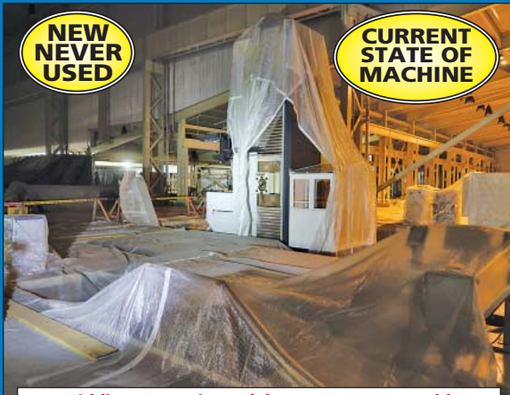
7.1" Giddings & Lewis Model FTR-5000 Rotary Table & Floor Type Traveling Column CNC Horizontal Boring Mill